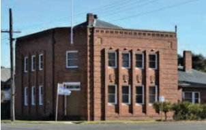
11b. The New Bank