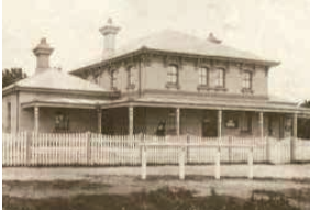
10. Gunning Courthouse circa1885

The Court House was built in two stages, in 1872 as a police station and in 1879 the fine late Victorian government building that faces Yass Street. The last cases were heard in 1979, it is now a community centre housing the Gunning District Community and Health Service. The Court Room in the centre front is used for special events and arts events such as chamber music and art exhibitions, the Court Room is open for inspection monthly during the Lions markets on the last Sunday of each month.