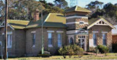
13. Gunning Shire Office

The precinct consists of three separate office buildings, built in 1915, 1971 and 1998 and a depot. Gunning Shire Council was established in 1906 and abolished on 11 February 2004, when Gunning and the northern part of Gunning Shire became part of the Upper Lachlan Shire.