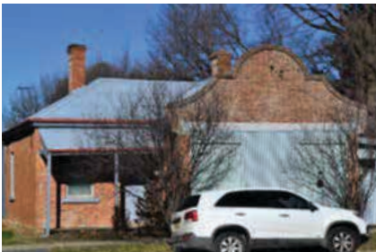
15. Old Saddlery

Originally built as a Blacksmith's and Wheelwrights, the front of the building was later used as a saddlery and then became Gunning Peerless Printer. Another of its uses was a branch of the Commonwealth Bank.