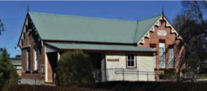
14. Gunning Public School

The milestone outside the school showing the distance in miles to Goulburn and Yass is accurate and reminds those of the days when the Hume Highway from Sydney to Melbourne passed directly through Gunning, until 5 April 1993.