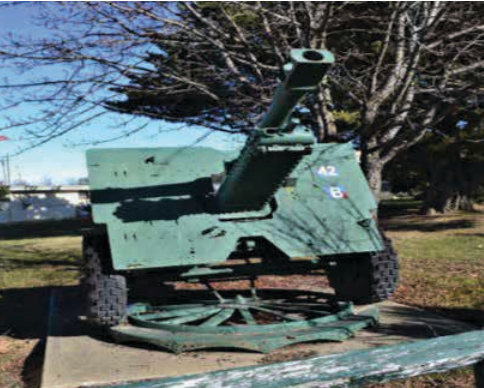
21. 25-pound Field Artillery Gun

Originally a 17-pound field artillery gun stood in Barbour Park. In 1996 the 23rd Field Artillery Regiment swapped that gun, for the one seen here a 25-pound field artillery gun.