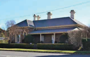
11a. The Old Bank

The two story art deco buildings at the western corner of Yass and Warrataw Streets was the bank building built in the 1930s to replace the late Victorian bank (next door along Yass Street). The old single story late Victorian bank building on Yass Street, next door to the art deco building was the first purpose-built bank in Gunning, opened in 1881.