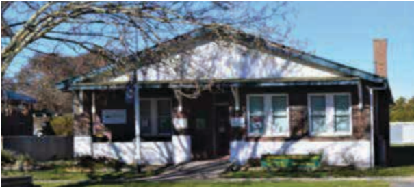
16. Gunning Library

The Gunning Library was built in 1924 by public subscription, to commemorate Hume and Hovell's momentous journey to Westernport Bay in 1824.