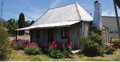
12. Pye Cottage