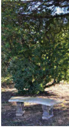
20. Memorial Grove

The trees in Memorial Grove were planted in 1956 and plaques dedicated to the fallen of the district were placed at their base. In 2001 the Grove was refurbished with roses, rosemary bushes and benches. The remaining plaques were fixed into the plinth near the Gates. Plaques for service personnel originally from the district, who died from war related causes and who were buried or cremated elsewhere, are also present.